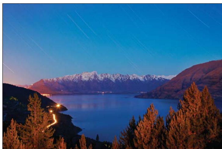
Photo taken with Giga T Pro Remote Control 36 minute exposure overlooking Lake Wakatipu in New Zealand's South Island.

Interchangeable connectors for different camera models