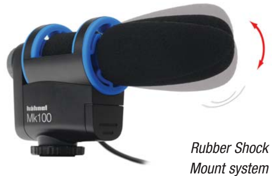
Rubber Shock Mount system